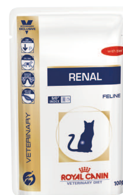
Pouch with Beef: 100g