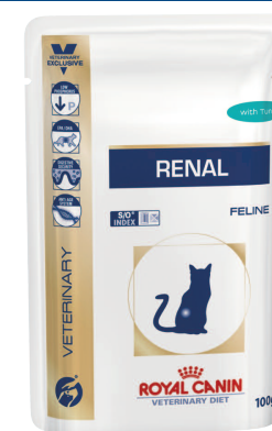
Pouch with Tuna: 100g

Beef Pork and poultry meats, beef meat, corn flour, fish oil, cellulose fibre, sunflower oil, calcium carbonate, minerals (including zeolite), taurine, Fructo-Oligo-Saccharides (FOS), marigold extract (rich in lutein), trace elements (including chelated trace elements), vitamins.